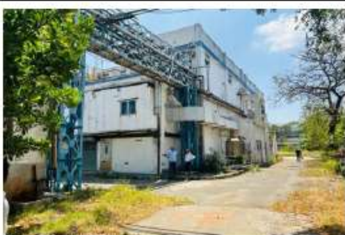
MAIN BUILDING VIEW