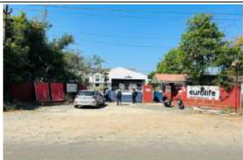
FRONT ELEVATION VIEW