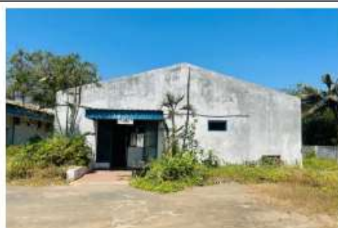
TRUSS ROOF BUILDING EXTERNAL VIEW