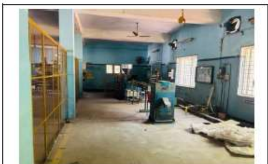
WORKSHOP AREA VIEW