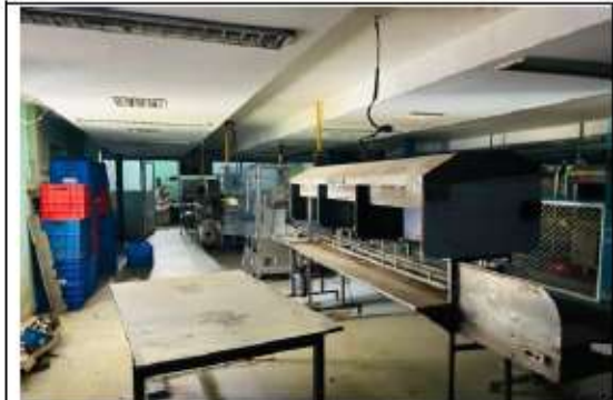
PROCESSING UNIT VIEW 2