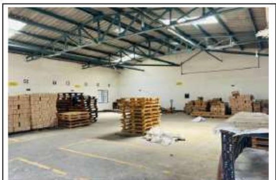
STORAGE AREA VIEW