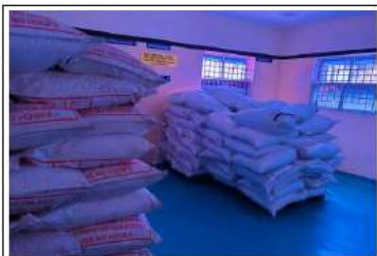
RAW MATERIAL STORAGE AREA VIEW