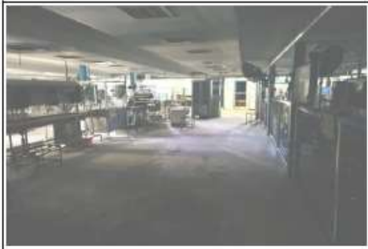
PROCESSING UNIT VIEW