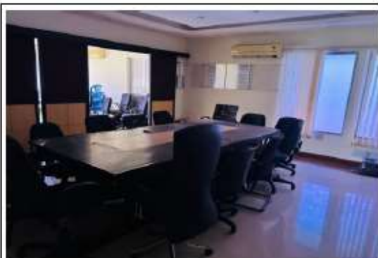
CONFERENCE HALL VIEW