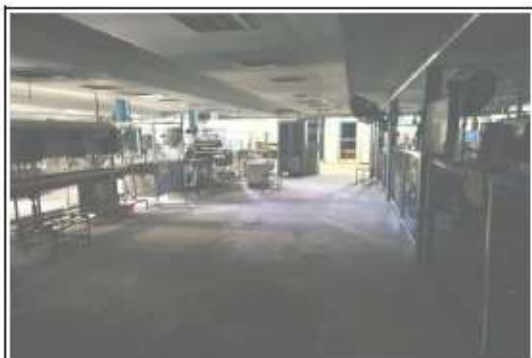
PROCESSING UNIT VIEW