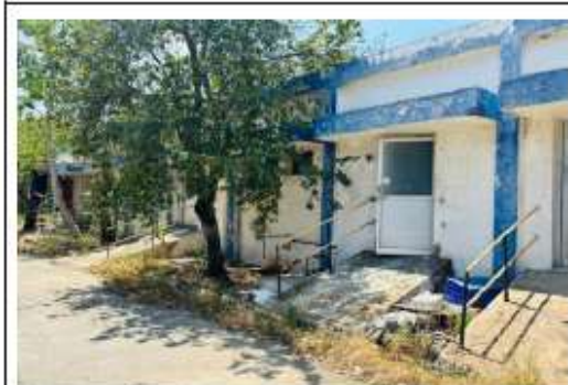
LABOURS SHED AREA VIEW