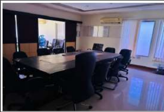
CONFERENCE HALL VIEW