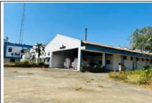
GI SHEET PROCESSING AREA VIEW