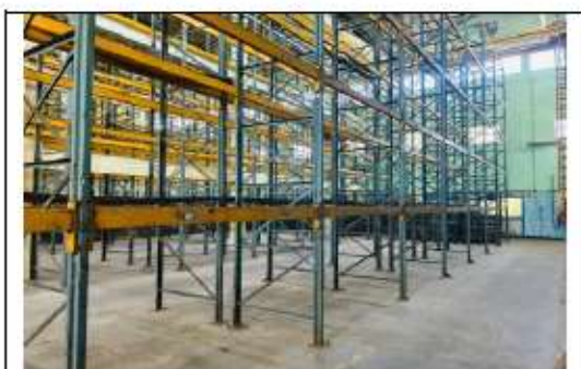
STORAGE GODOWN VIEW