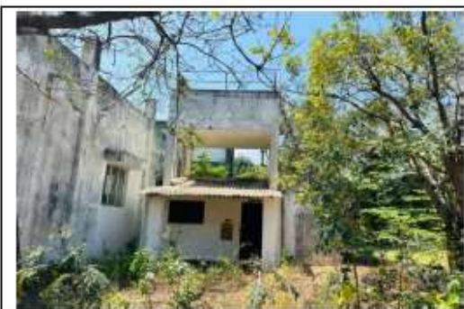
OHT AREA VIEW