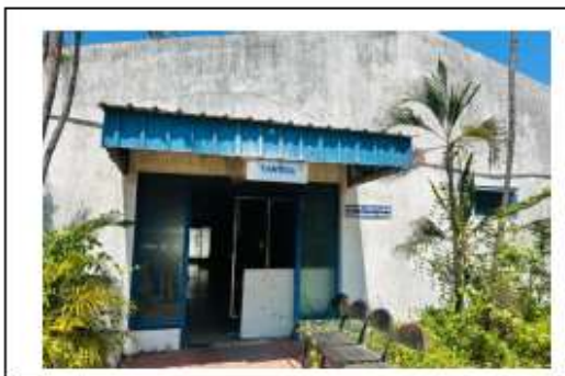
CANTEEN BUILDING EXTERNAL VIEW