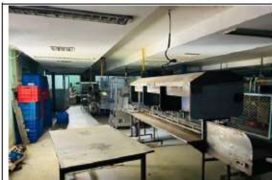
PROCESSING UNIT VIEW 2