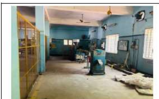
WORKSHOP AREA VIEW