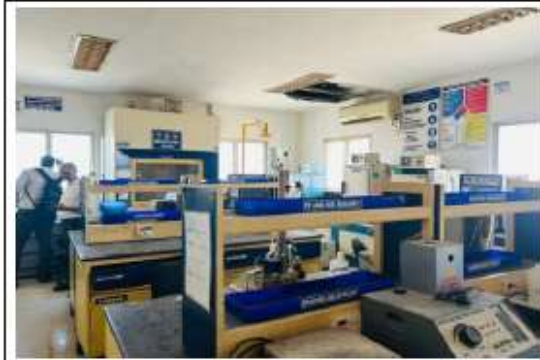
TESTING CUM LABORATORY AREA VIEW